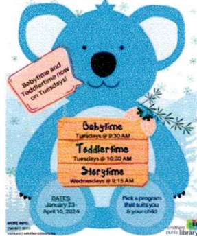
Children's Programs @ the Library

Date Changes: Book Lovers' Night Out will move to the second Tuesday of the month at the library. Thanks to Wetzin'kwa Community Forest Corp. for their ongoing support. Babytime and Toddlertime will move from Mondays to Tuesdays .