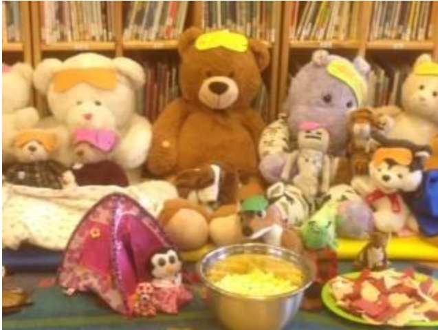
Teddy Bear Sleepover