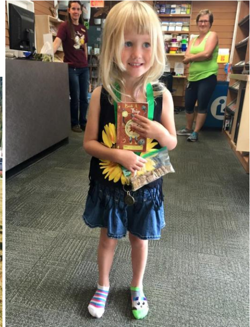
SRC Wrap-up Party & Medal Ceremony; First 2016 medal recipient