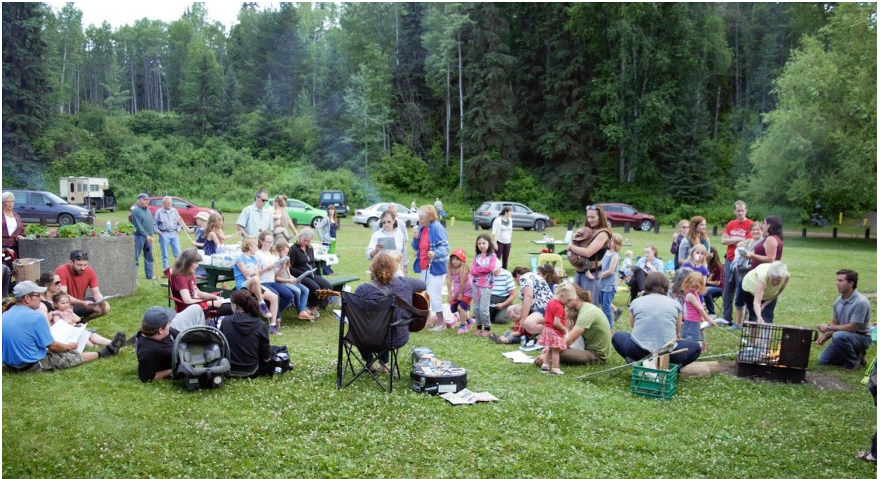
Campfire Cookout & Singalong